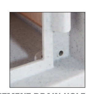
COMPARTMENT DRAIN HOLE SITS NEATLY OUT OF SIGHT BEHIND THE DOOR*