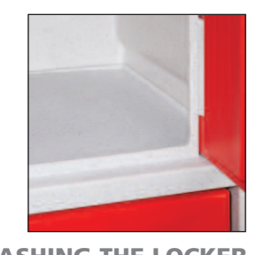
AFTER WASHING THE LOCKER THE SLOPING SHELF DIRECTS WATER TO THE DRAIN HOLE Drain hole is sealed on Ultrabox plus

*The drain hole is sealed on the Ultrabox Plus version