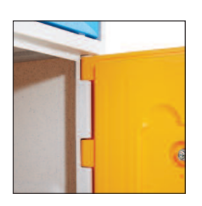
HEAVY DUTY, VANDAL PROOF CONCEALED HINGES